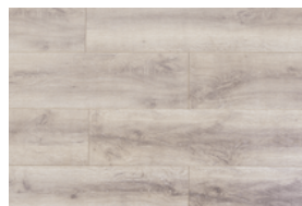
CALEDON 1 STRIP V4 – MATT WOODGRAIN