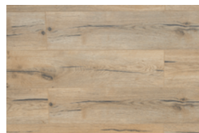
BUFFALO 1 STRIP V4 – EIR