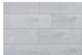
STORM 1 STRIP V4 – MATT WOODGRAIN