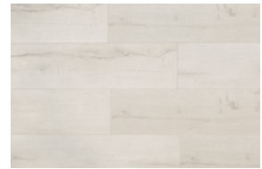
ATHENS OAK V4 – EIR