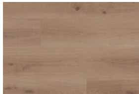
JUKSKEI 1 STRIP V4 – MATT WOOD GRAIN