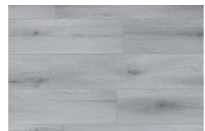
LIMPOPO 1 STRIP V4 – MATT WOOD GRAIN