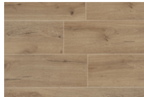
UMGENI 1 STRIP V4 – MATT WOOD GRAIN