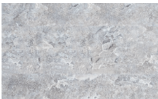
TOURMALINE – 1 TILE CORAL STONE FINISH AND 4-SIDED MICRO BEVEL