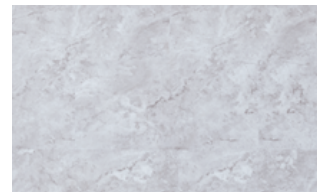
GREY PEARL– 1 TILE CORAL STONE FINISH AND 4-SIDED MICRO BEVEL