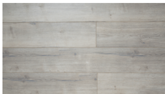
WHITE ELDER 1 STRIP V4 – EIR