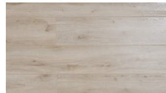
MAPLEWOOD MIST 1 STRIP V4 – EIR