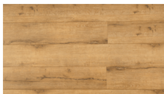
OAKWOOD MANOR 1 STRIP V4 – EIR