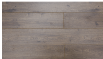
WOODLAND OAK 1 STRIP V4 – MATT WOOD GRAIN