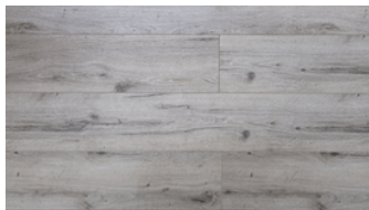
NORDIC GREY 1 STRIP V4 – MATT WOOD GRAIN